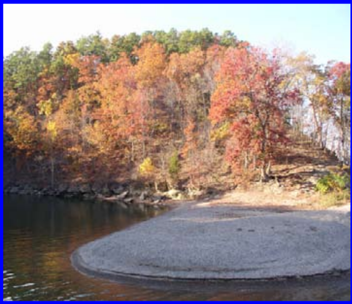
Pickwick Lake is also known for its secluded beaches and hillsides with flowering shrubs and trees in spring and riotous color in autumn.