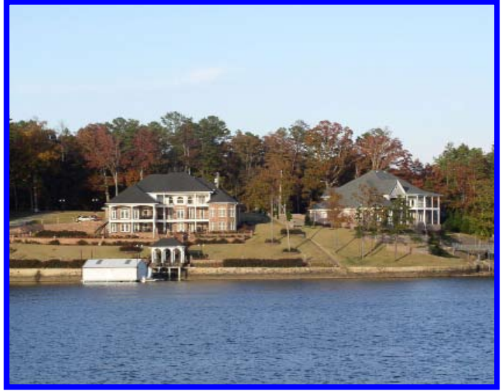
There are hundreds of fine homes built on the shores of Pickwick Lake. Some are weekend and vacation homes while many others are occupied year around.