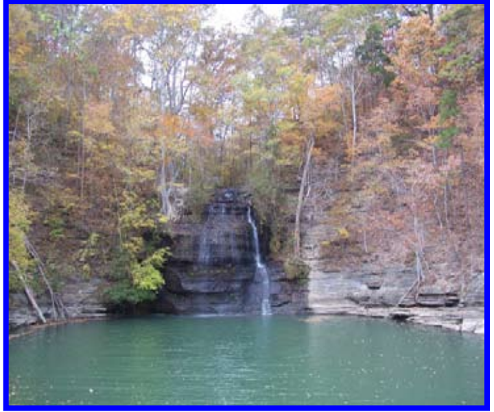
Tishomingo County is famous for its lakes, parks, waterfalls, hilly terrain, and quaint Appalachian villages.

In addition to being widely known as the “Outdoor Recreation Capital of the Mid-South”, Tishomingo County has received the following ratings: