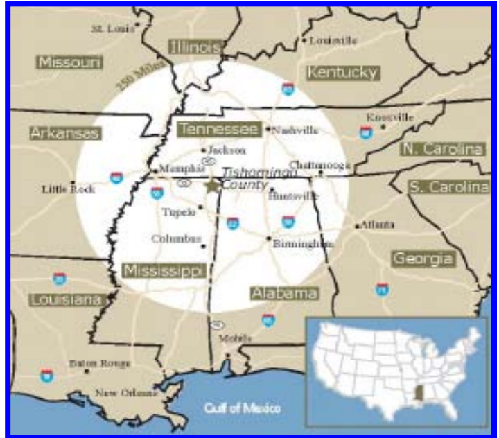
Tishomingo County, Mississippi, is located in the northeast corner of Mississippi adjacent to Alabama and Tennessee.

With 50,000 acres/20,234 hectares of lakes, seven marinas, eight resort and retirement communities, two state parks, several Corps of Engineers parks, the Natchez Trace Parkway, and too many boat ramps to count, Tishomingo County, Mississippi, USA, is widely known as the “Outdoor Recreation Capital of the Mid-South” .