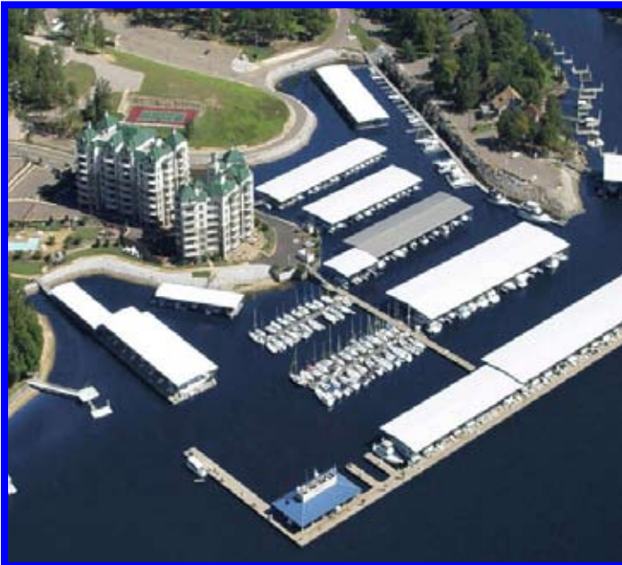
Located on Pickwick Lake, Grand Harbor Marina and Condominiums is one of America's finest resort and retirement communities.