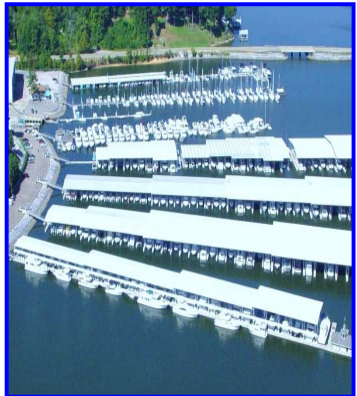
Aqua Yacht Harbor is one of the largest freshwater marinas in the USA. One of seven marinas, Aqua Yacht Harbor offers wet and dry boat storage for 600 boats of all sizes. Aqua Yacht Harbor is the third largest inland marina in the United States.

Proximity to metro areas rounds out the advantages of Tishomingo County. Tishomingo County has earned the respect of vacationers and retired persons who have moved here from all over the USA and Canada.