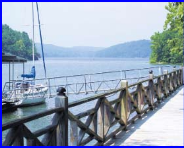
Located on Pickwick Lake, Union Harbor Resort and Marina offers a secluded residential and retirement community on the wooded hills overlooking Pickwick Lake.